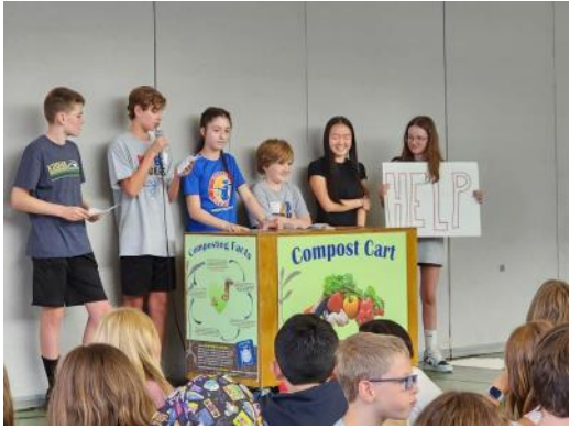
continued on next page